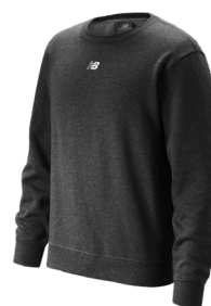
BKH Black Heather