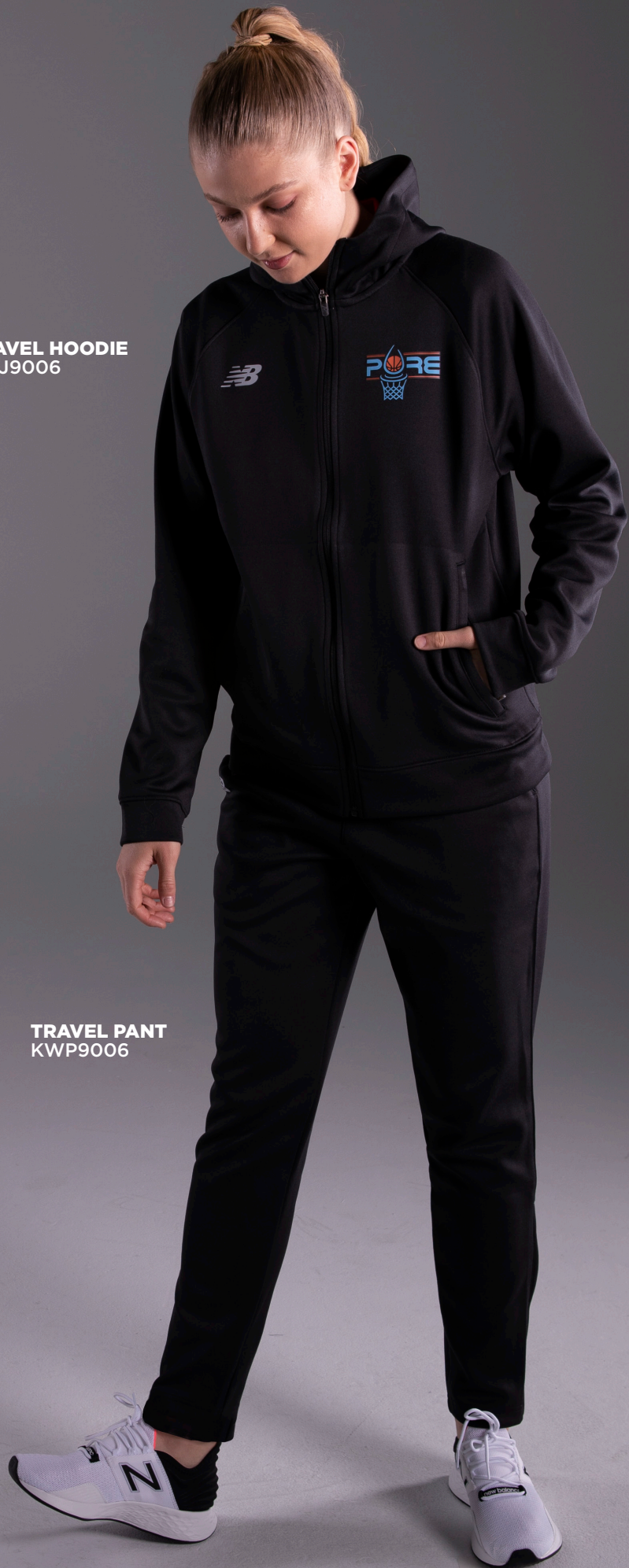
FRESH FOAM ROAV