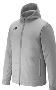
LG Light Grey