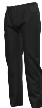
TBK Team Black