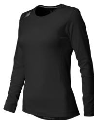
TBK Team Black