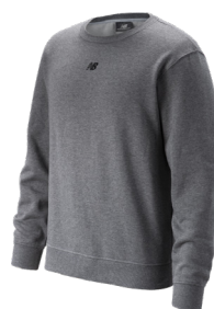
MGH Grey Heather