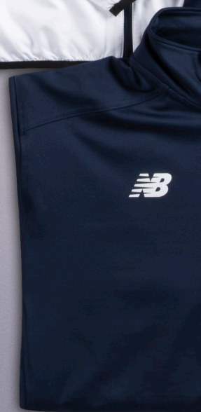
TECH TEE TMMT500 See pg. 12