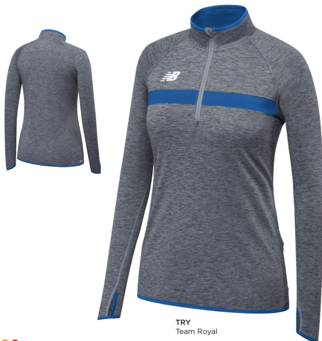
TRY Team Royal