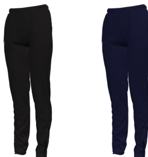
TBK Team Black