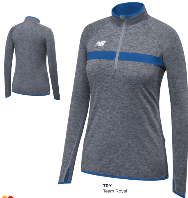
TRY Team Royal