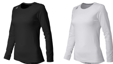
TBK Team Black