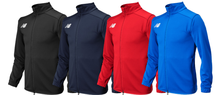
BK Black NV Navy RD Red RL Royal