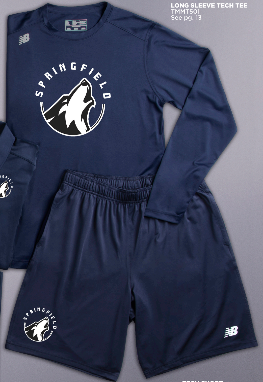
TECH SHORT TMMS555 See pg. 14