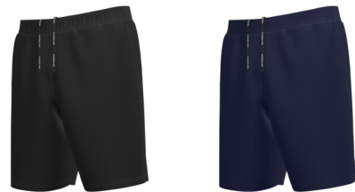
TBK* Team Black TNV* Team Navy