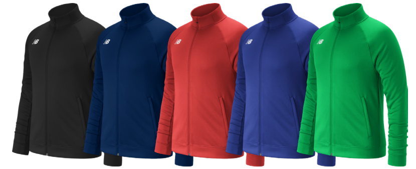
TBK Team Black