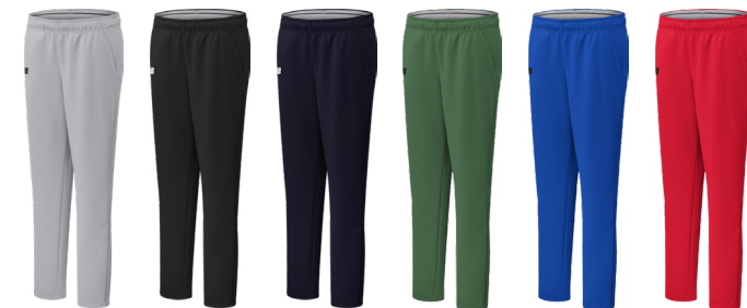
LG Light Grey TBK Team Black TNV Team Navy TDG Dark Green TRY Team Royal TRE Team Red