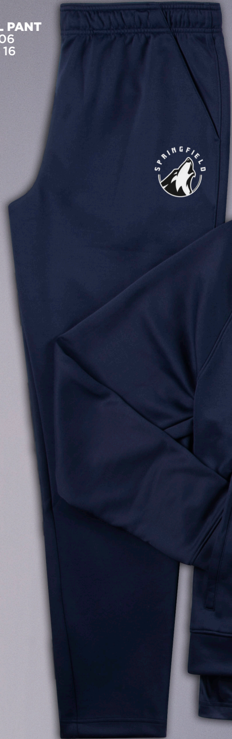
TRAVEL PANT KMP9006 See pg. 16