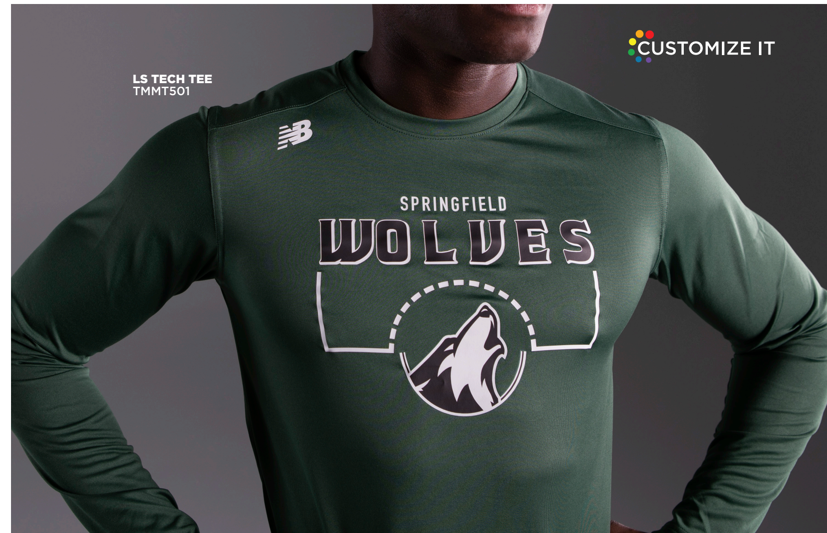
LS TECH TEE TMMT501