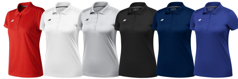
TRE Team Red WT White LG Light Grey TBK Team Black TNV Team Navy TRY Team Royal