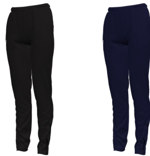
TBK Team Black TNV Team Navy