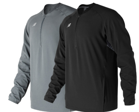
GNM Gunmetal TBK Team Black