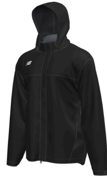
TBK Team Black