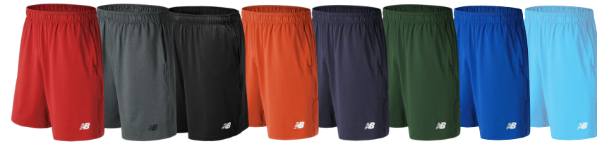
TRE Team Red DH* Dark Heather TBK* Team Black TMO Team Orange TNV* Team Navy TDG Team Dark Green TRY Team Royal CB Columbia Blue