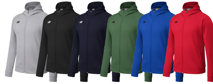
LG Light Grey TBK Team Black TNV Team Navy TDG Dark Green TRY Team Royal TRE Team Red