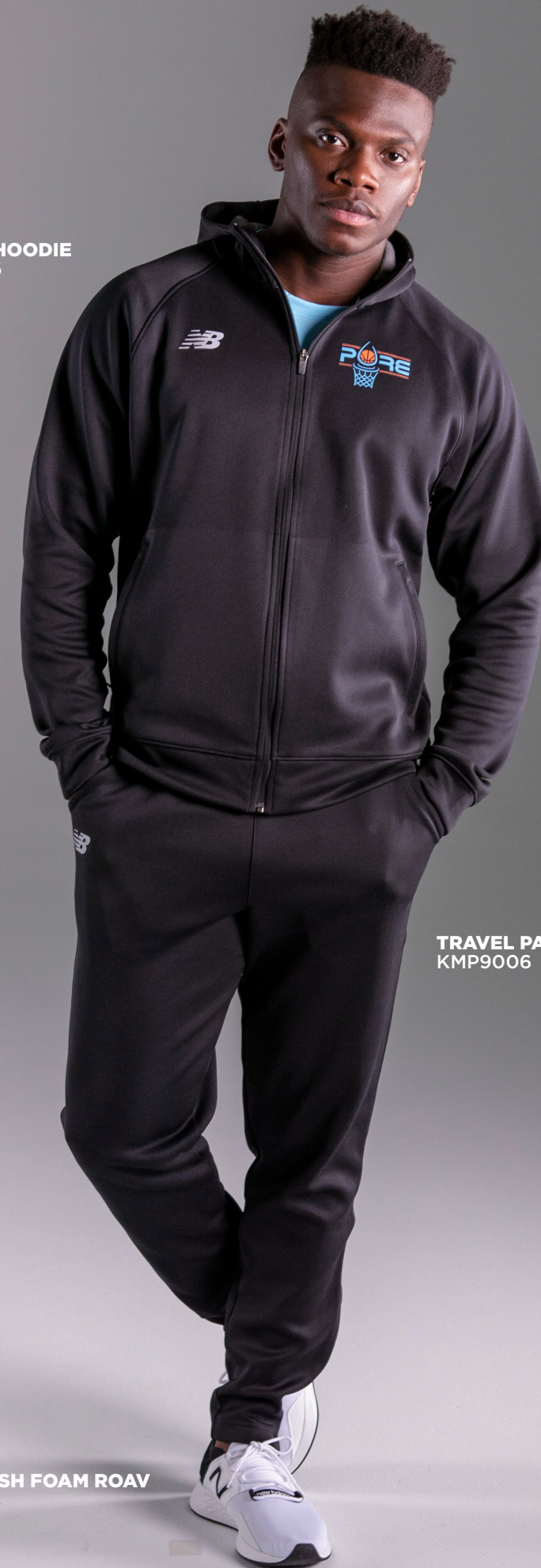
TRAVEL PANT KMP9006