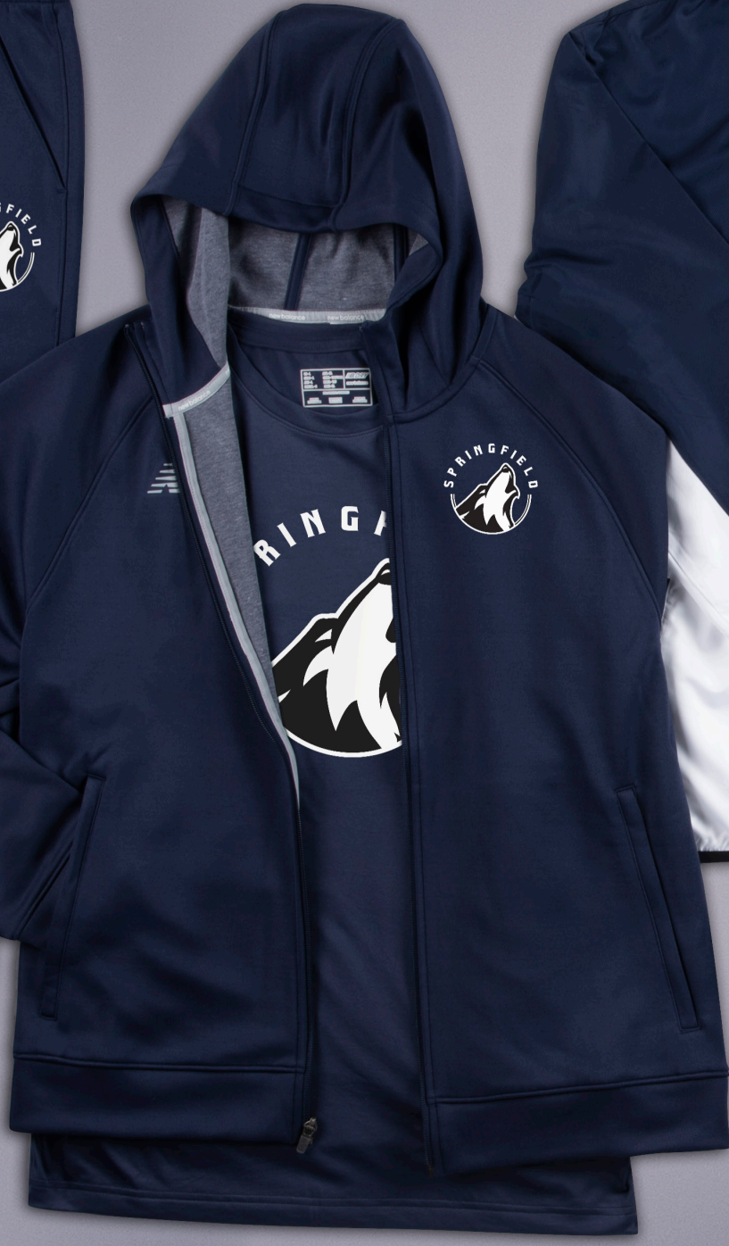
TECH TEE TMMT500 See pg. 12