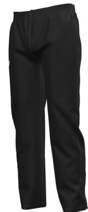
TBK Team Black