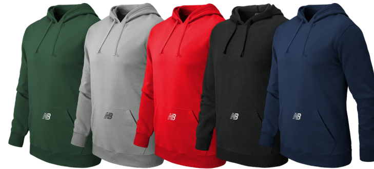
TDG Team Dark Green GNM Gun Metal TRE Team Red TBK Team Black TNV Team Navy