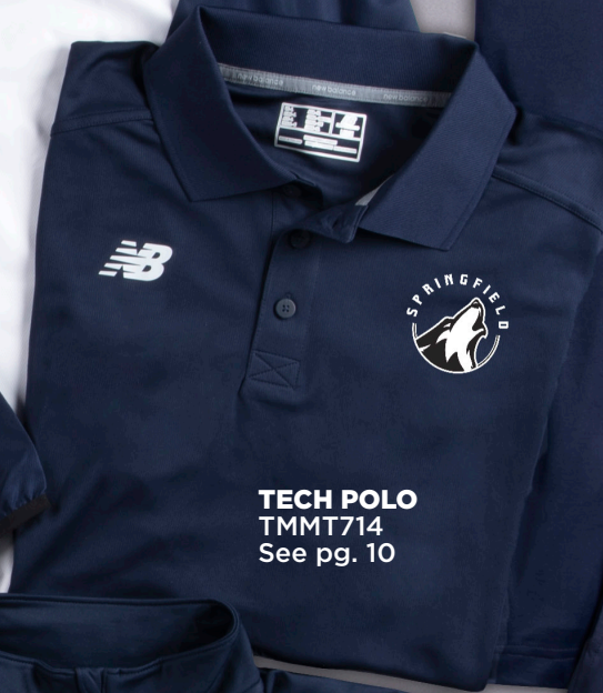
TECH POLO TMMT714 See pg. 10