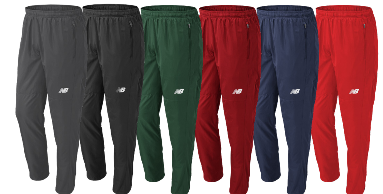
AST Asphat TBK Team Black TDG Team Dark Green TMC Team Cardinal TNV Team Navy TRE Team Red