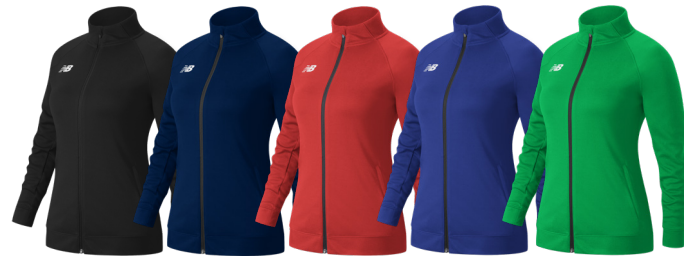
TBK Team Black TNV Team Navy TRE Team Red TRY Team Royal GN Team Green