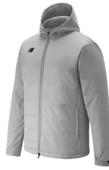
LG Light Grey