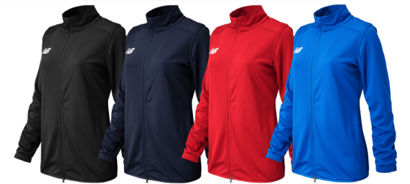
BK Black NV Navy RD Red RL Royal