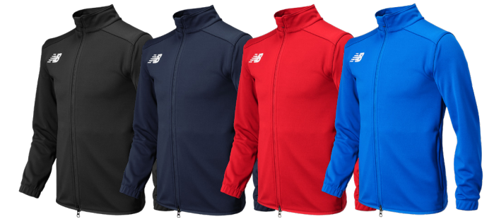
BK Black NV Navy RD Red RL Royal