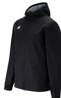
TBK Team Black