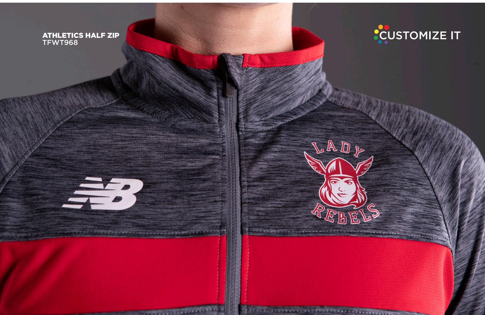
ATHLETICS HALF ZIP TFWT968