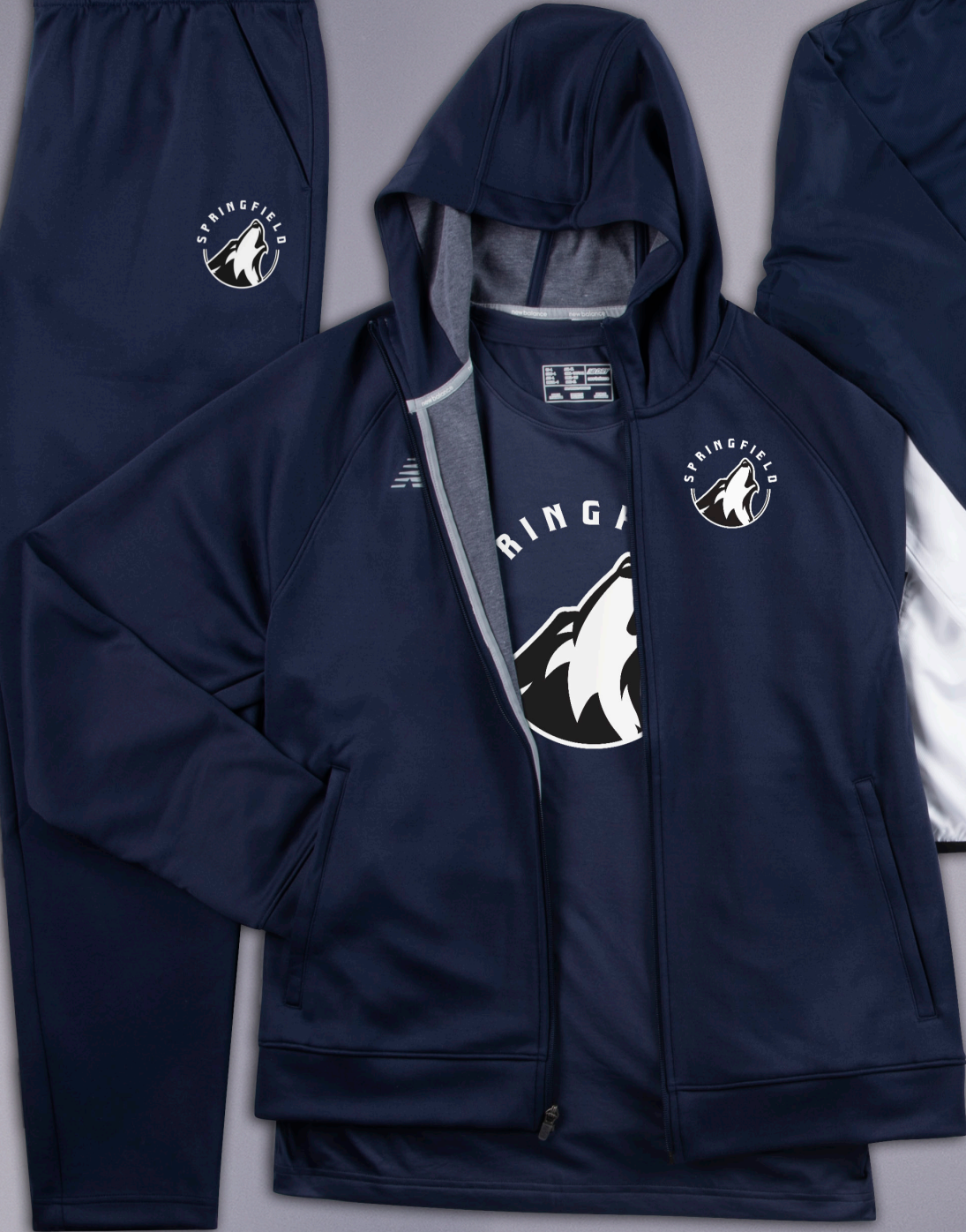
TECH TEE TMMT500 See pg. 12