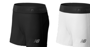
TBK Team Black