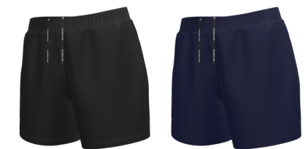
TBK* Team Black TNV* Team Navy