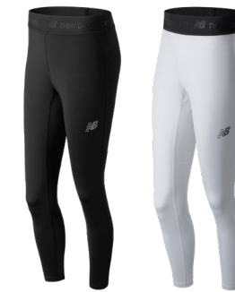
TBK Team Black