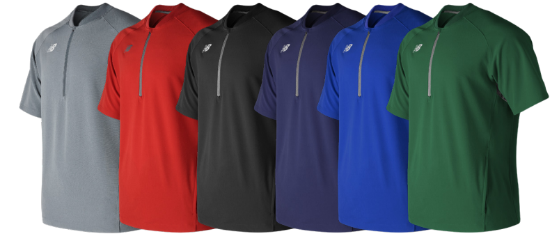
GNM Gunmetal REP Team Red TBK Team Black TNV Team Navy TRY Team Royal TDK Team Dark Green