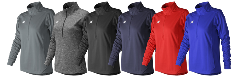
GNM Gunmetal MHG Heather Grey TBK Team Black TNV Team Navy TRE Team Red TRY Team Royal