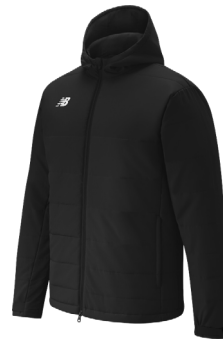
TBK Team Black