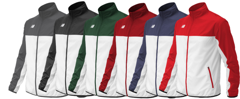
AST Asphalt TBK Team Black TDG Team Dark Green TMC Team Cardinal TNV Team Navy TRE Team Red