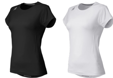
TBK Team Black