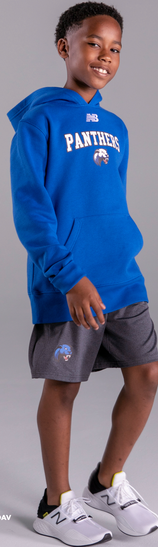
TECH SHORTS TMYS555