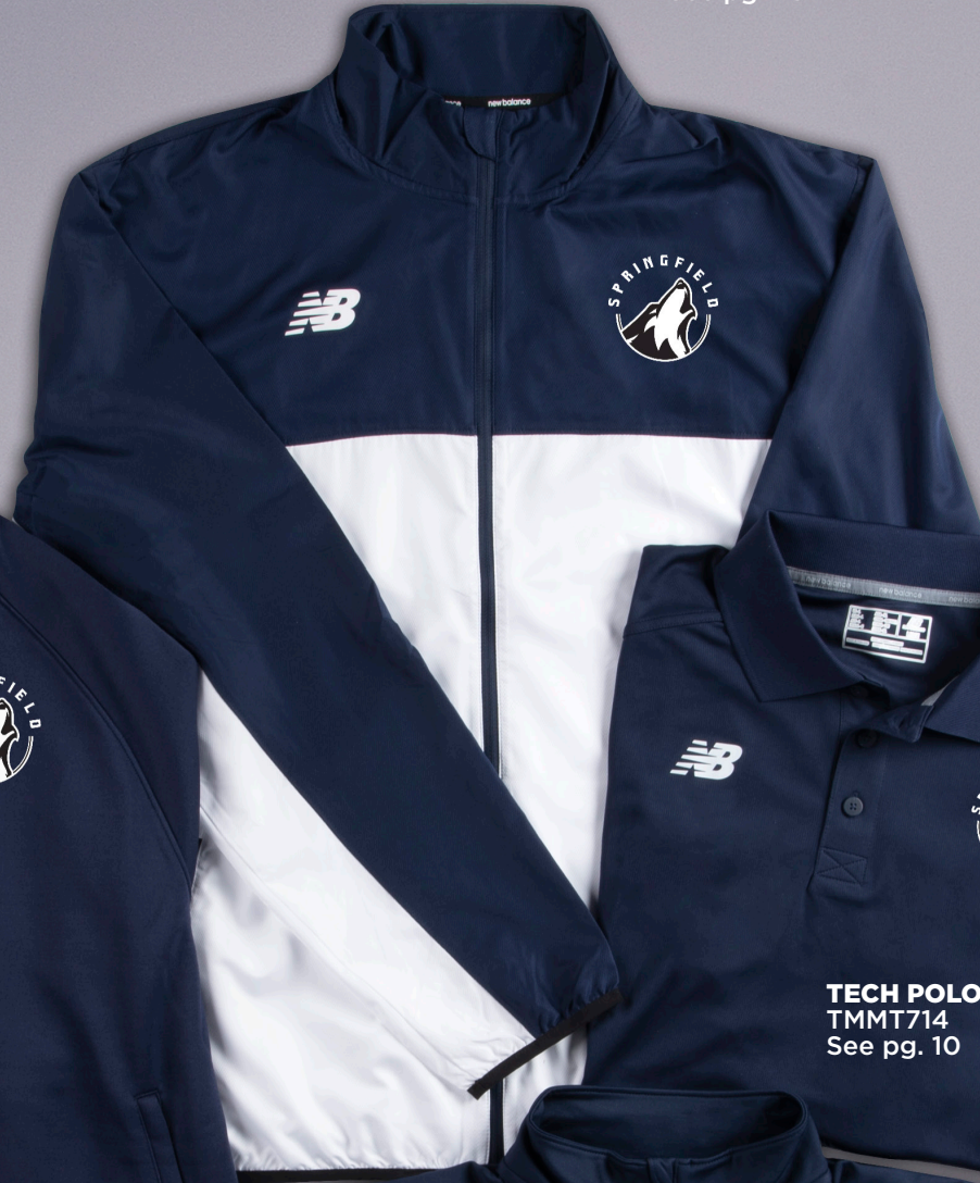
TECH POLO TMMT714 See pg. 10