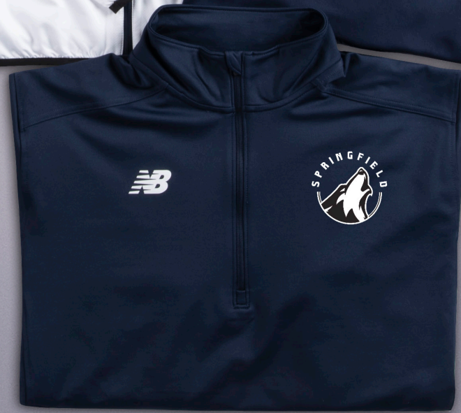
LIGHTWEIGHT SOLID HALF ZIP TMMT710 See pg. 19