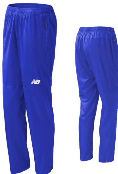
TRY Team Royal