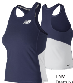
TNV Team Navy