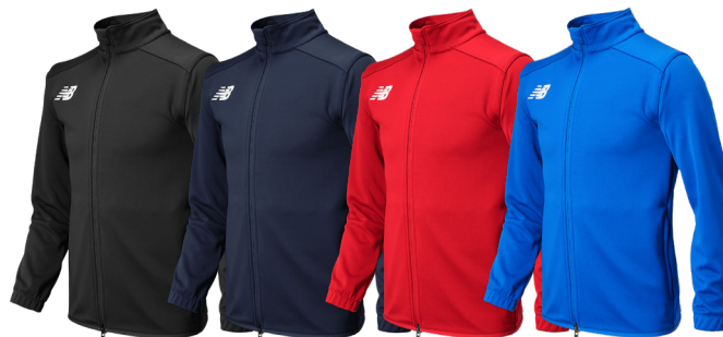
TBK Team Black