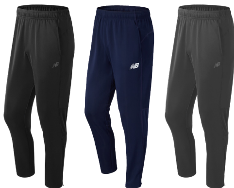
TBK Team Black

Select your colors, logos, designs, and personalized text at www.newbalanceteam.com/track-field