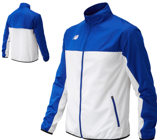
TRY Team Royal