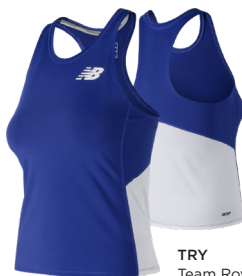
TRY Team Royal