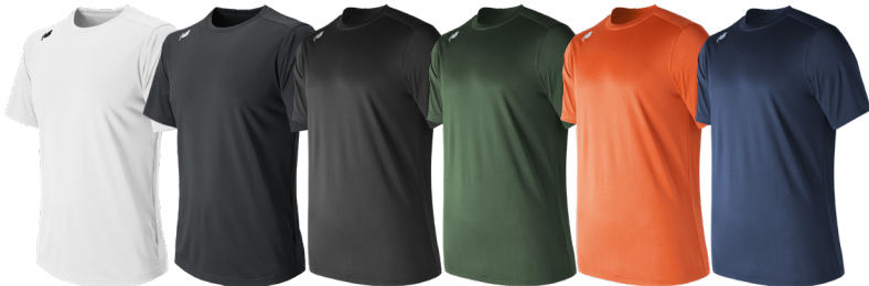
WT White DH Dark Heather TBK Team Black TDG Team Dark Green TMO Team Orange TNV Team Navy