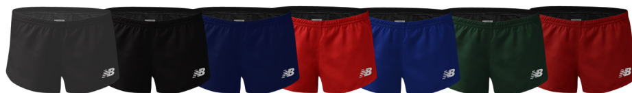
AST Asphalt TBK Team Black TNV Team Navy TRE Team Red TRY Team Royal TDG Team Dark Green TMC Team Cardinal

Select your colors, logos, designs, and personalized text at www.newbalanceteam.com/track-field