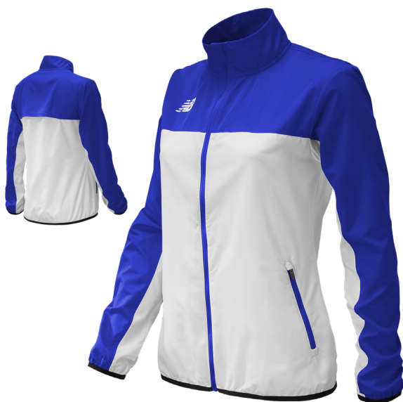
TRY Team Royal