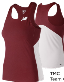
TMC Team Cardinal