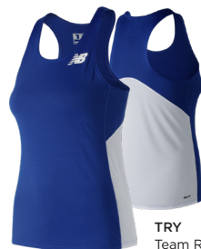
TRY Team Royal