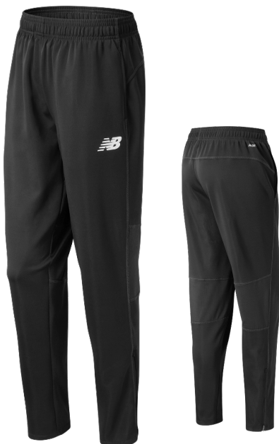
TBK Team Black