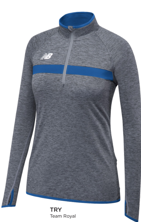
TRY Team Royal