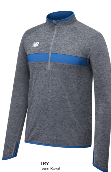
TRY Team Royal