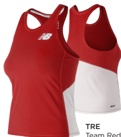
TRE Team Red

Select your colors, logos, designs, and personalized text at www.newbalanceteam.com/track-field