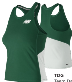
TDG Team Dark Green