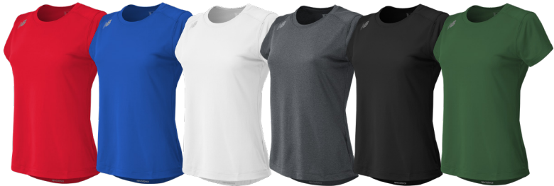
TRE Team Red TRY Team Royal WT White DH Dark Heather TBK Team Black TDG Team Dark Green