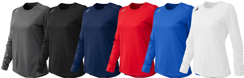
DH Dark Heather TBK Team Black TNV Team Navy TRE Team Red TRY Team Royal WT White