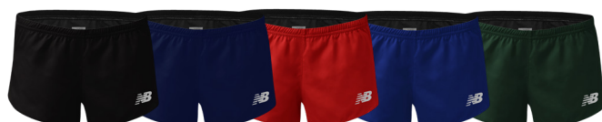
TBK Team Black TNV Team Navy TRE Team Red TRY Team Royal TDG Team Dark Green

Select your colors, logos, designs, and personalized text at www.newbalanceteam.com/track-field