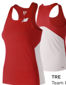
TRE Team Red