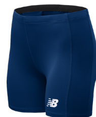
TNV Team Navy