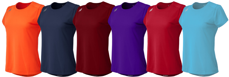
TMO Team Orange TNV Team Navy TMR Team Maroon TPU Team Purple TMC Team Cardinal CB Columbia Blue