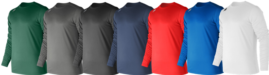
TDG Team Dark Green DH Dark Heather TBK Team Black TNV Team Navy TRE Team Red TRY Team Royal WT White