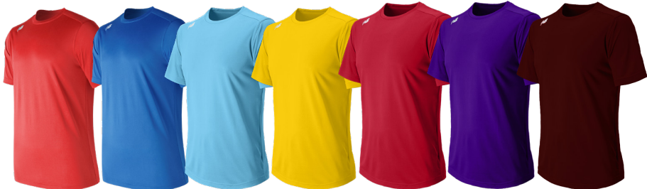
TRE Team Red TRY Team Royal CB Columbia Blue ATG Athletic Gold TMC Team Cardinal TPU Team Purple TMR Team Maroon