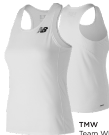
TMW Team White