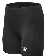
TBK Team Black