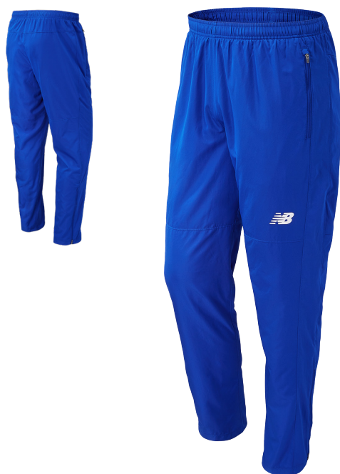
TRY Team Royal