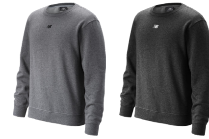
MGH Grey Heather BKH Black Heather