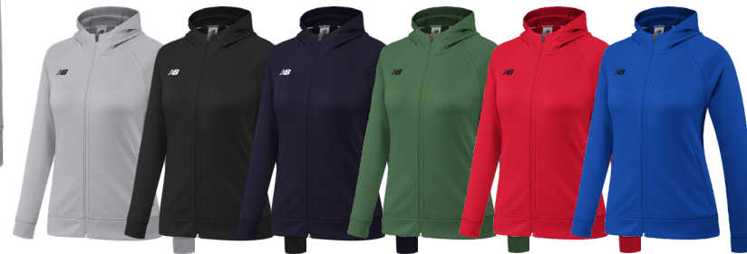
LG Light Grey TBK Team Black TNV Team Navy TDG Dark Green TBK Team Black TNV Team Navy