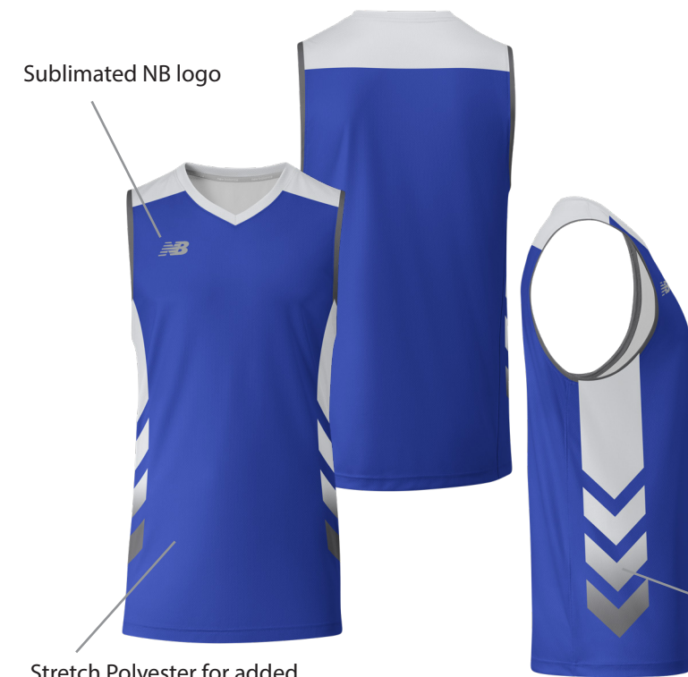
Sublimated NB logo