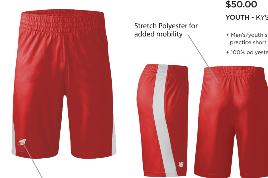
Sublimated NB logo