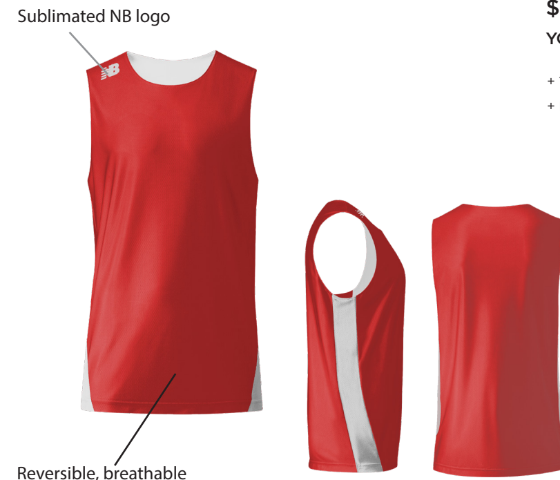
Sublimated NB logo