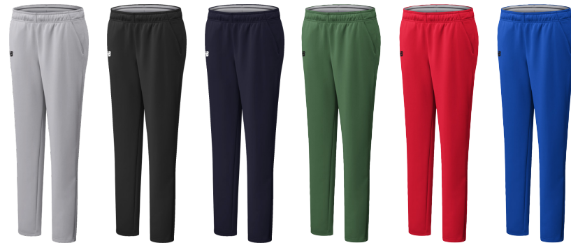
LG Light Grey TBK Team Black TNV Team Navy TDG Dark Green TBK Team Black TNV Team Navy