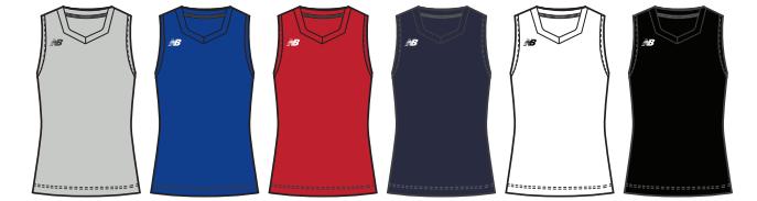
LG Light Grey TRY Team Royal TRE Team Red TNV Team Navy WT White TBK Team Black