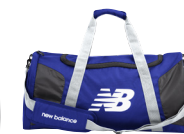
UVB Ultra Violet Blue