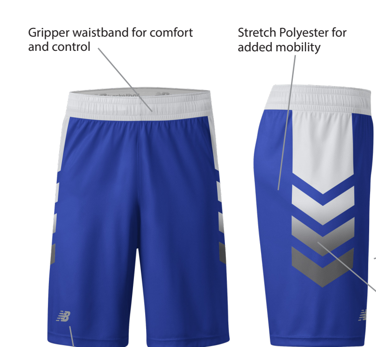
Gripper waistband for comfort and control