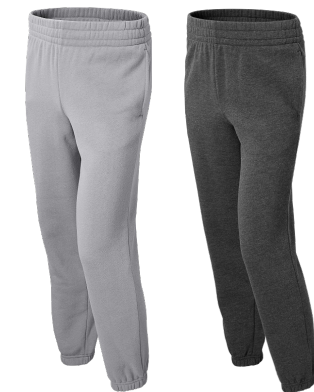
ALY Alloy BKH Black Heather