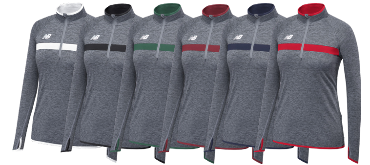
TWT White TBK Team Black TDG Team Dark Green TMC Team Cardinal TNV Team Navy TRE Team Red