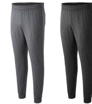
MGH Grey Heather BKH Black Heather