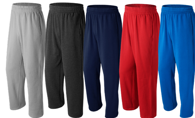
ALY Alloy BKH Black Heather TNV Team Navy TRE Team Red TRY Team Royal