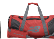
TRE Team Red