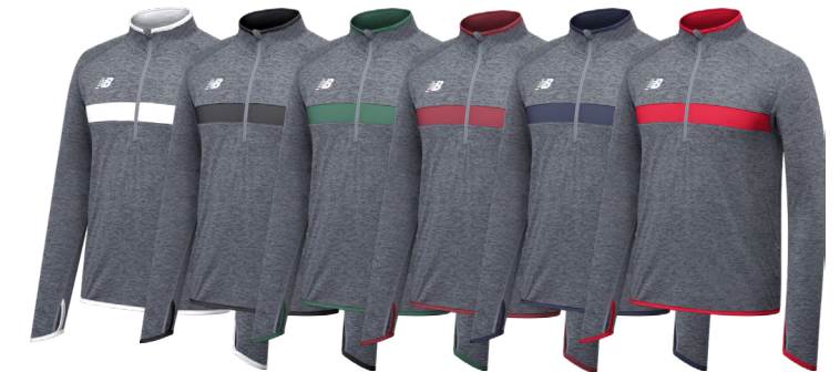
TWT White TBK Team Black TDG Team Dark Green TMC Team Cardinal TNV Team Navy TRE Team Red