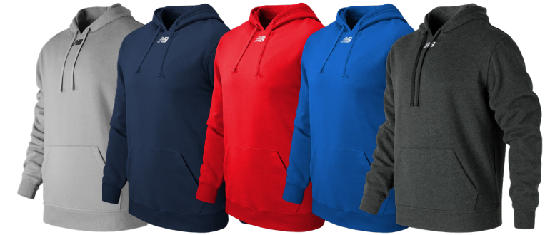
ALY Alloy TNV Team Navy TRE Team Red TRY Team Royal BKH Black Heather